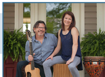
Sunday July 3, 2016