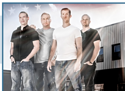
Saturday July 2, 2016