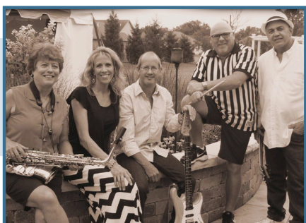
Friday July 1, 2016